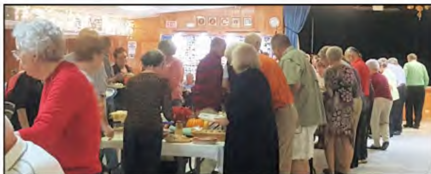
EVERYONE TO THE SERVING TABLES.